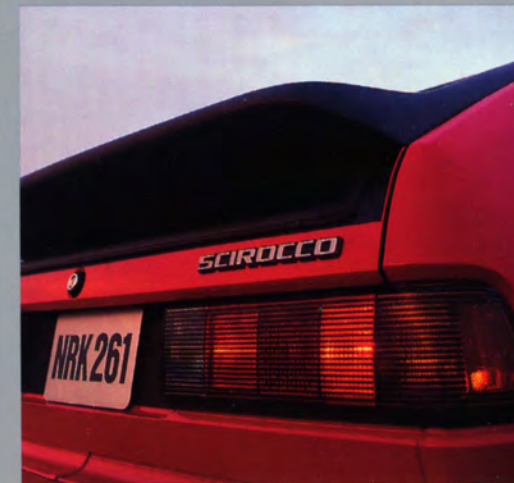
Sporty alloy wheels and black interior are standard on the Black or Tornado Red Scirocco. The White Scirocco features a white interior and a unique design white alloy wheel.