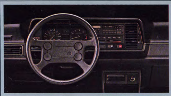
Wolfsburg Limited Edition Quantum Wagon in Flash Silver Metallic.

Who says driving a station wagon has to be dull?