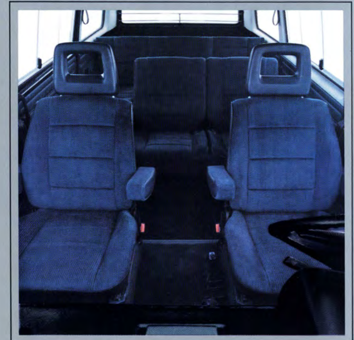
Wolfsburg Limited Edition Vanagon in Marine Blue.