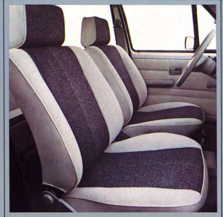
Wolfsburg Limited Edition Rabbit in Diamond Silver Metallic.

*See EPA mileage estimates on back cover.