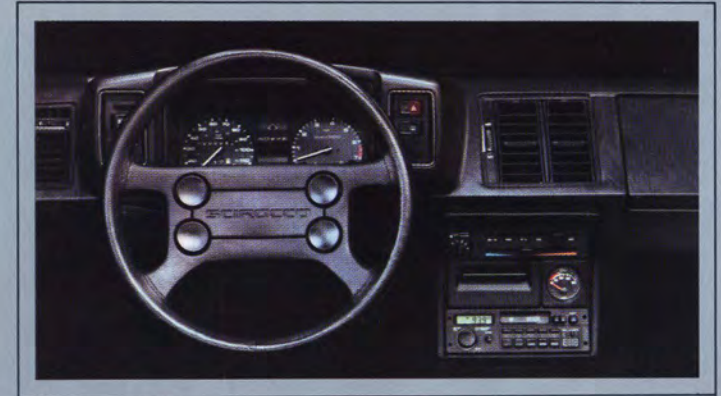
Wolfsburg Limited Edition Scirocco in Mars Red.