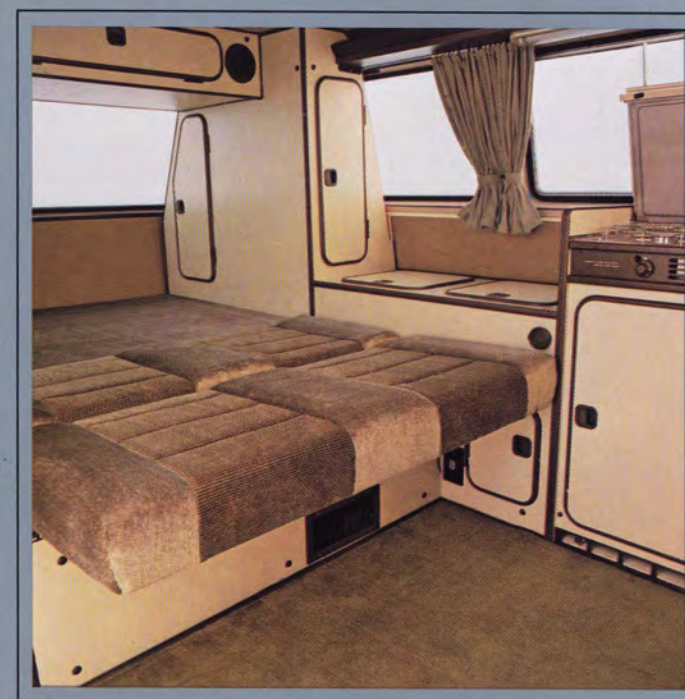
Wolfsburg Limited Edition Vanagon Camper in Merian Brown and Toscana Beige.

Volkswagen of America, Inc. believes the specifications in this brochure to be correct at time of printing. However, specifications, standard equipment and options are subject to change without notice. Some options may be unavailable when your vehicle is built. Please ask your dealer for advice concerning current availability of options and verify that your vehicle includes the optional equipment you ordered.