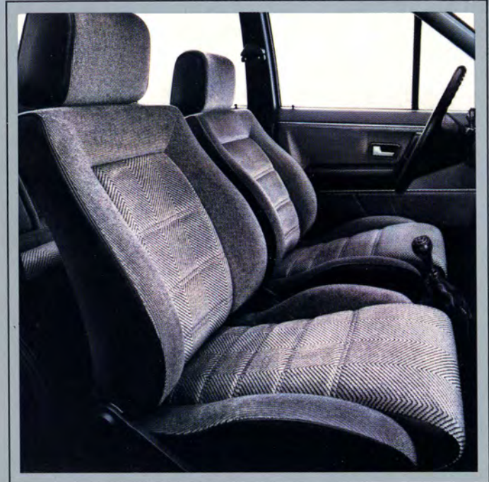
Wolfsburg Limited Edition Quantum Sedan in Sapphire Metallic.