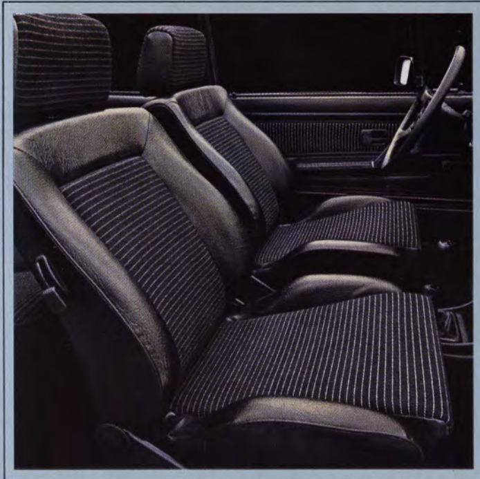
Wolfsburg Limited Edition Convertible in Black Metallic.