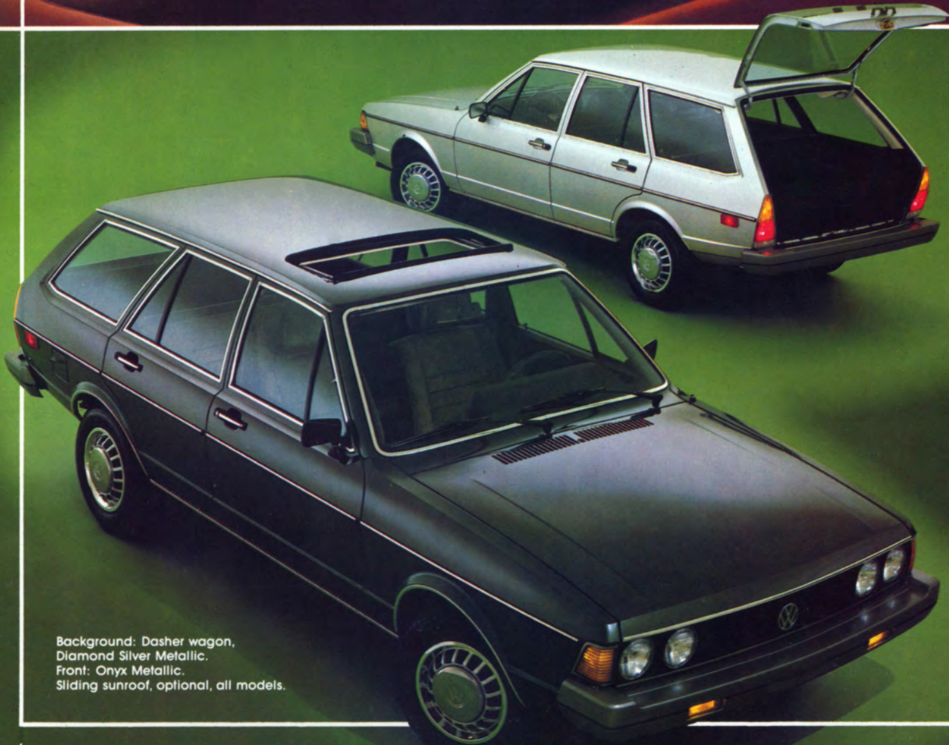
Background: Dasher wagon, Diamond Silver Metallic. Front: Onyx Metallic. Sliding sunroof, optional, all models.