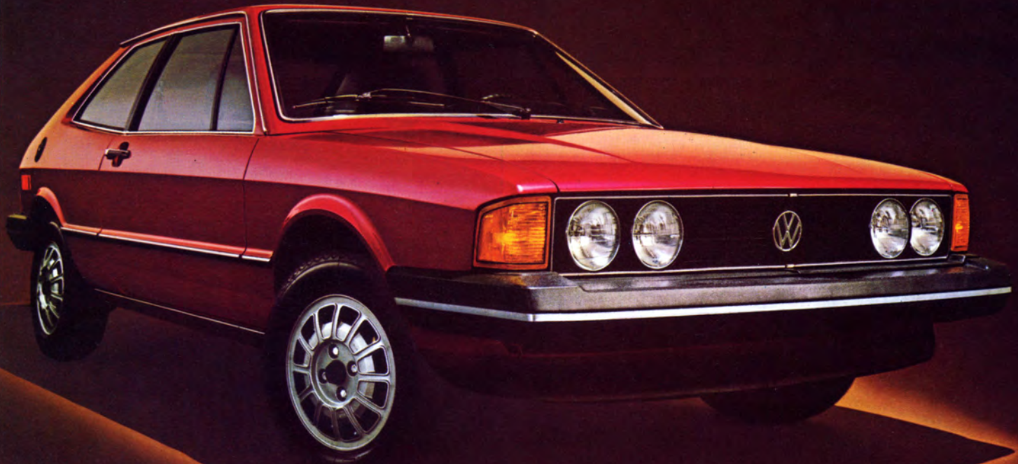
Scirocco, Indiana Red Metallic. The 1.6L, fuel-injected, overhead camshaft engine is standard.