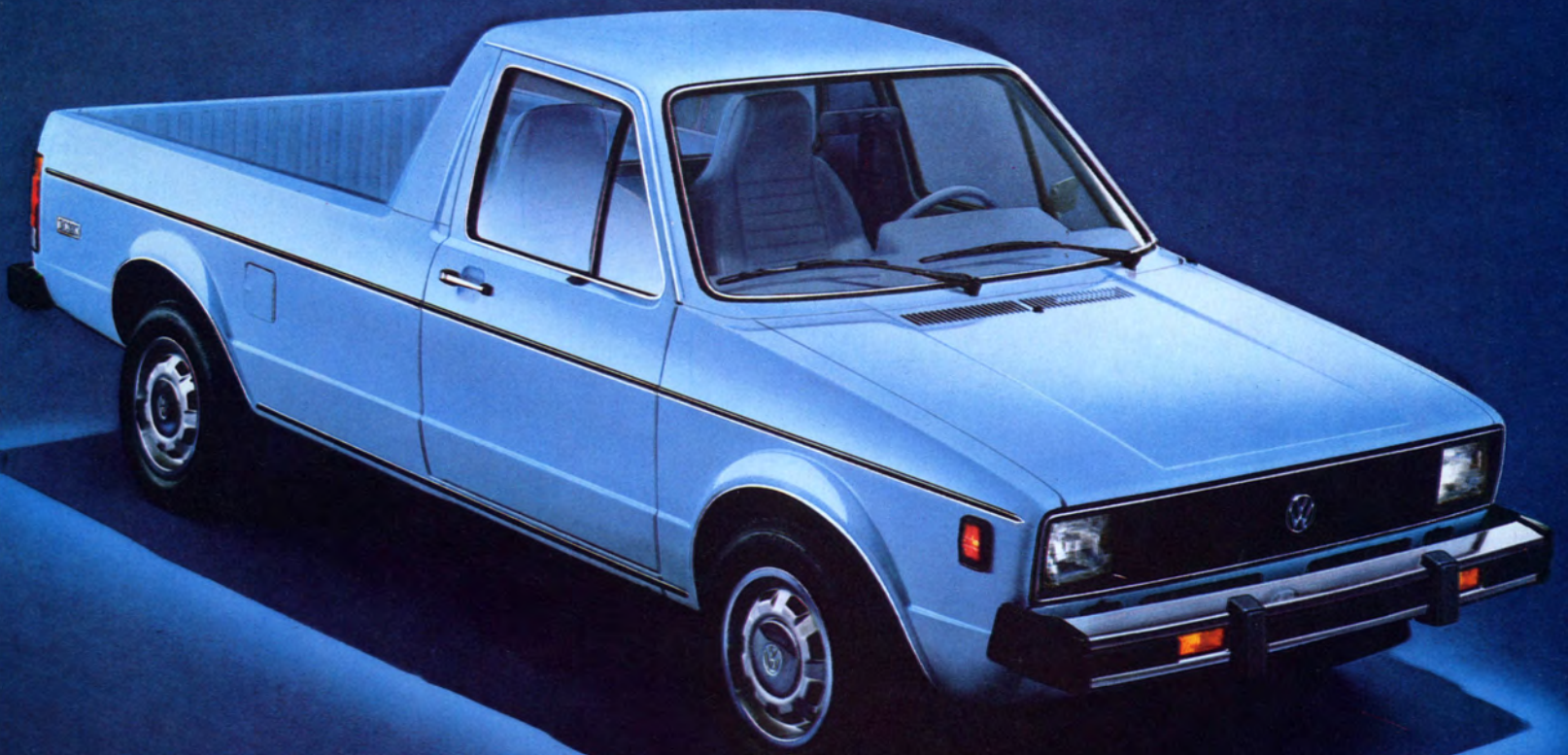
VW Pickup Truck "LX", Lago Blue. Cargo box is 72" long. Removable tailgate, standard.