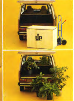
Top: Topaz cloth interior, Vanagon "L". Bottom: Vanagon rear compartment can carry varied, bulky loads. (Carton is 45" wide, 34" high, 25" deep.)