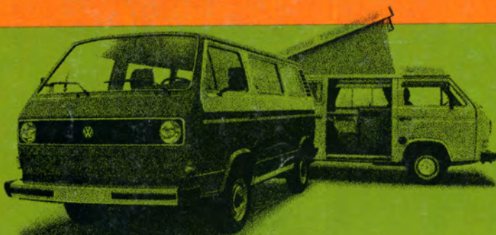
Vanagon Vanagon Camper