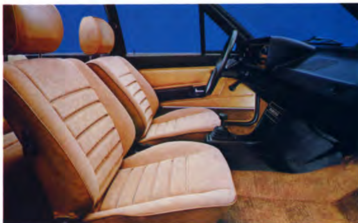
VW Dasher interior, Gazelle crushed velour.

Dasher is the product of sound engineering, skillful styling and outstanding craftsmanship. You will know it as soon as you test-drive one.