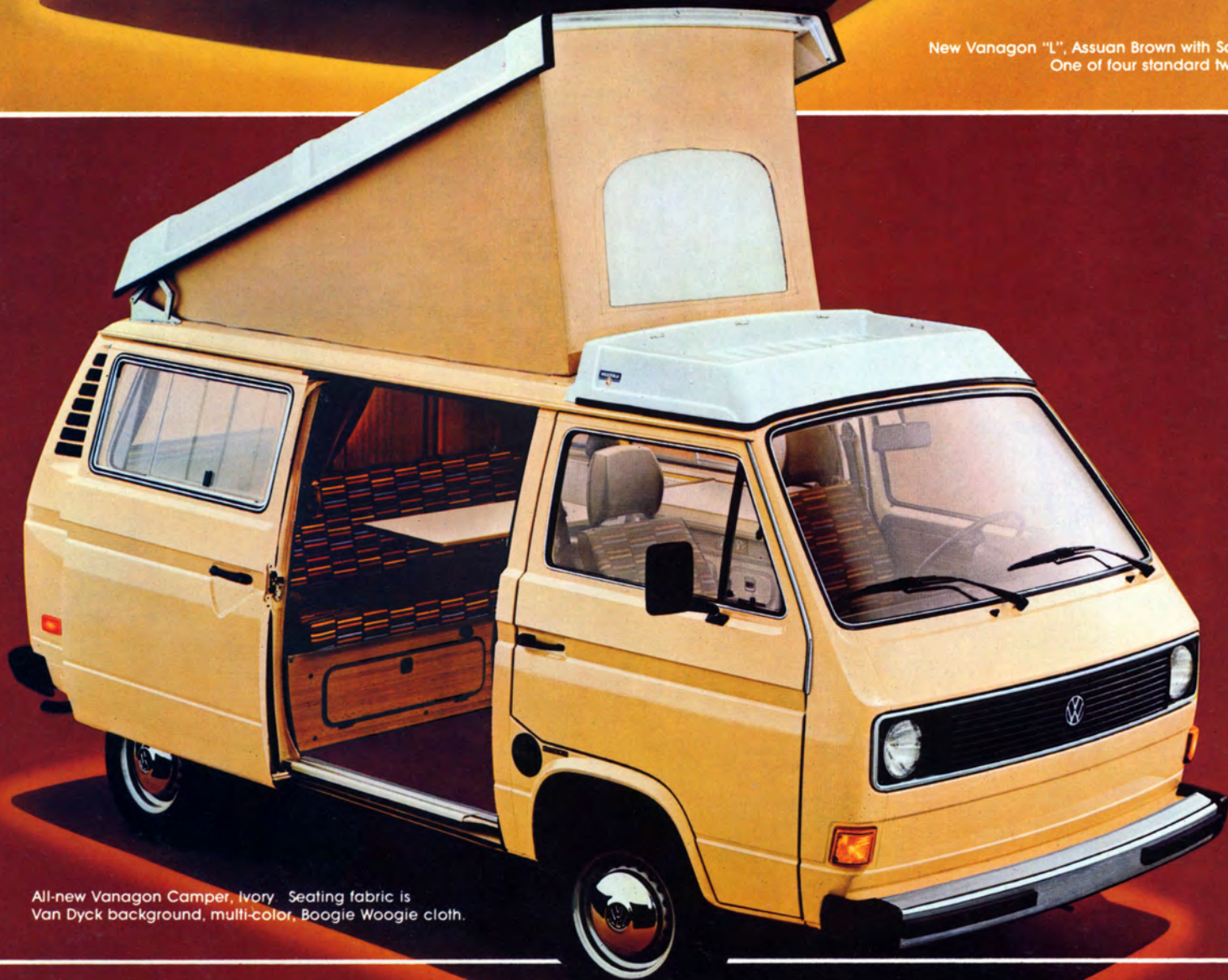
All-new Vanagon Camper, Ivory. Seating fabric is Van Dyck background, multi-color, Boogie Woogie cloth.