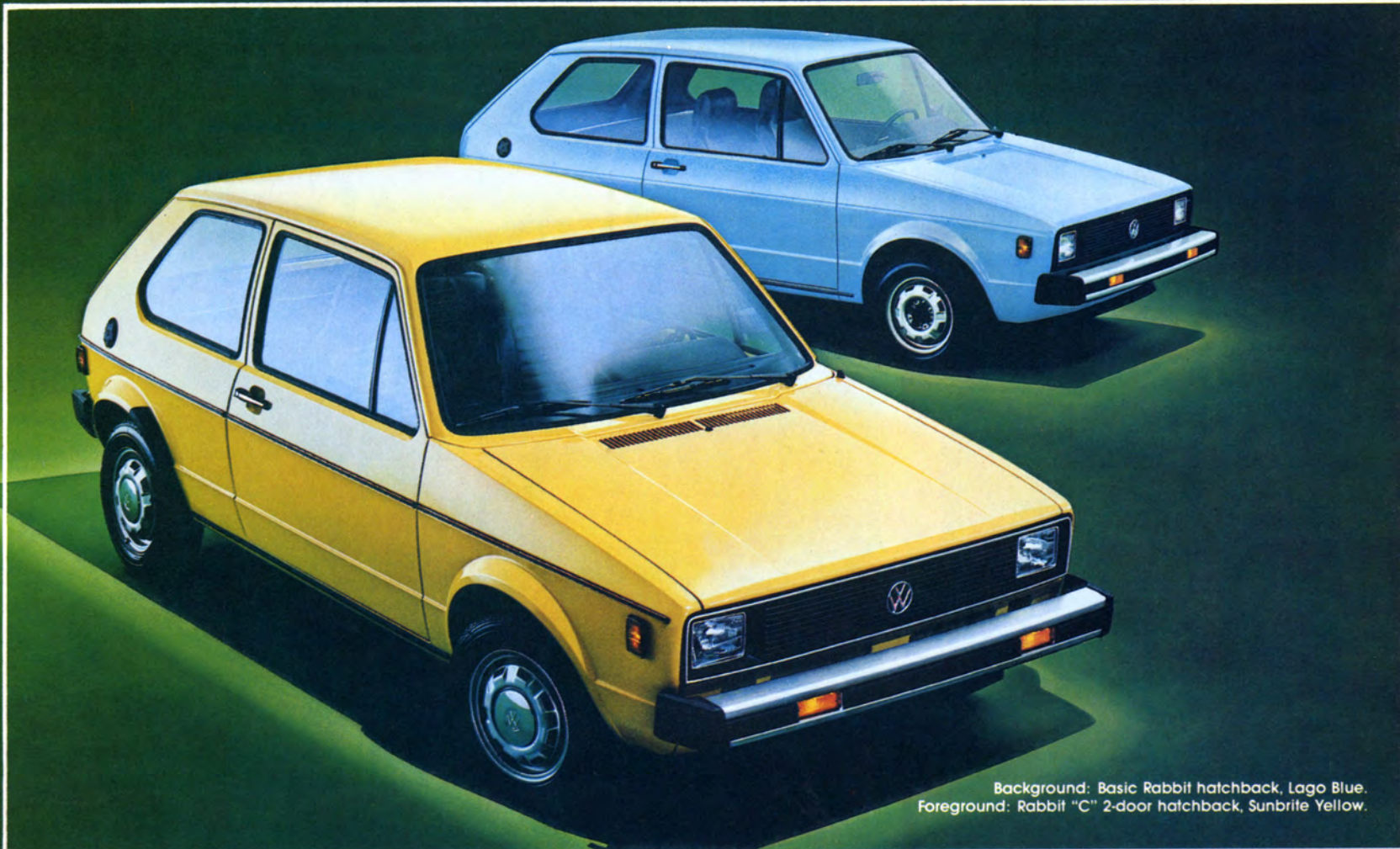
Background: Basic Rabbit hatchback, Lago Blue. Foreground: Rabbit "C" 2-door hatchback, Sunbrite Yellow.