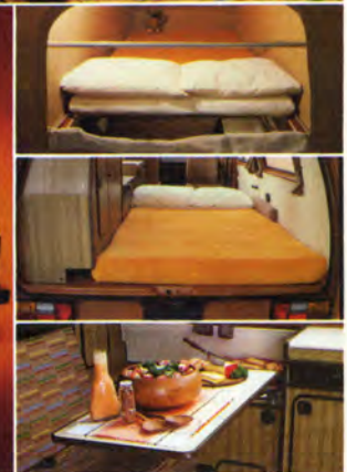
Vanagon Deluxe (P27) Camper has 2-burner cookstove and 3-way refrigerator. All Vanagon Campers offer two double beds (upper and lower), plus handy swing-away dining tables.