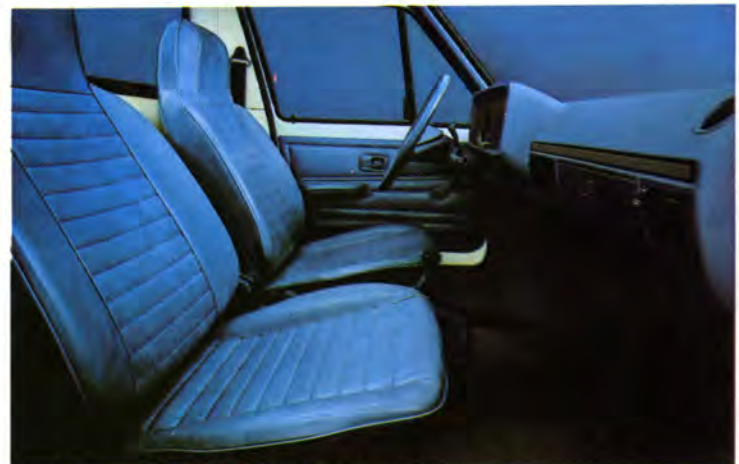
VW Pickup Truck interior, Blue vinyl. Choice of ten exterior colors, four interior trims. Vinyl or cloth.

It's time you expected more from a small pickup truck. And Volkswagen delivers what you've been looking for. Expect proven Volkswagen technology, traditional VW fit and finish, and front-wheel drive. Expect tight, strong unitized construction. Expect more truck for the money. Expect a vehicle that's built like a truck— but drives like something else!