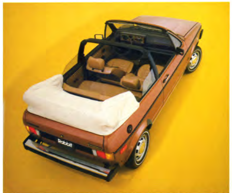
Rabbit 4-seater convertible in Brazil Brown Metallic. Interior: Gazelle. Top: Sand.

Diesel and 1.6-liter fuel-injected engine, optional on Rabbit C and L hatchbacks. The 1.6L fuel-injected engine is standard on Rabbit convertible. Models sold in California use 1.6L fuel-injected engine as standard equipment.