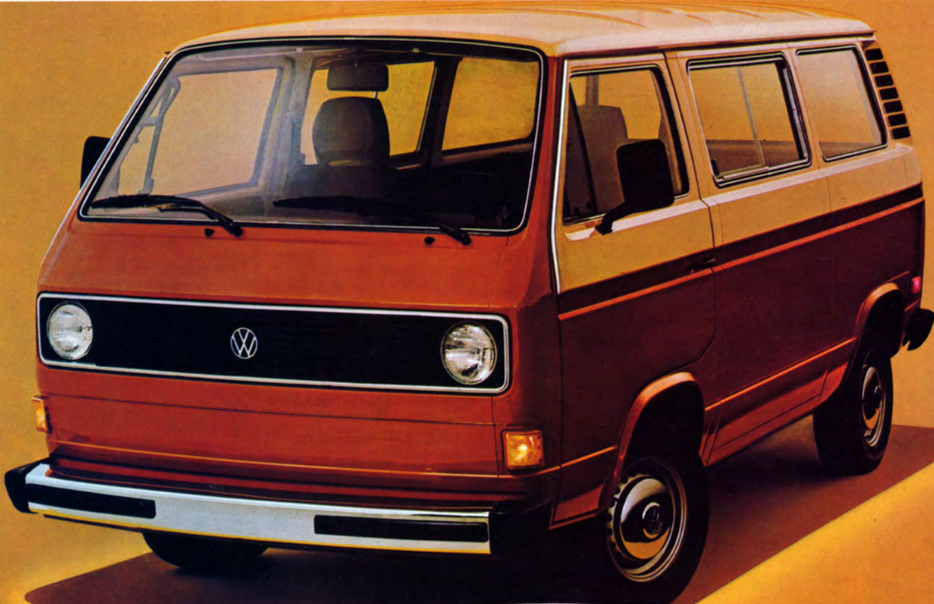
New Vanagon "L", Assuan Brown with Samos Beige, top. One of four standard two-tone exteriors.