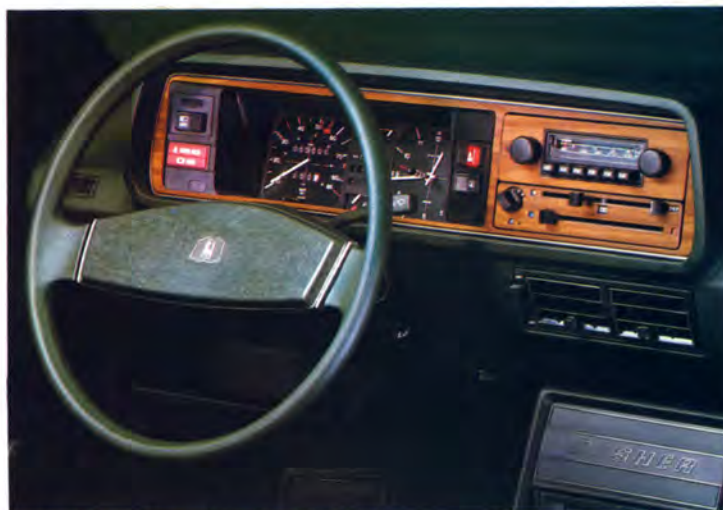
Handsomely appointed instrument panel is standard on all 1980 Dasher models.