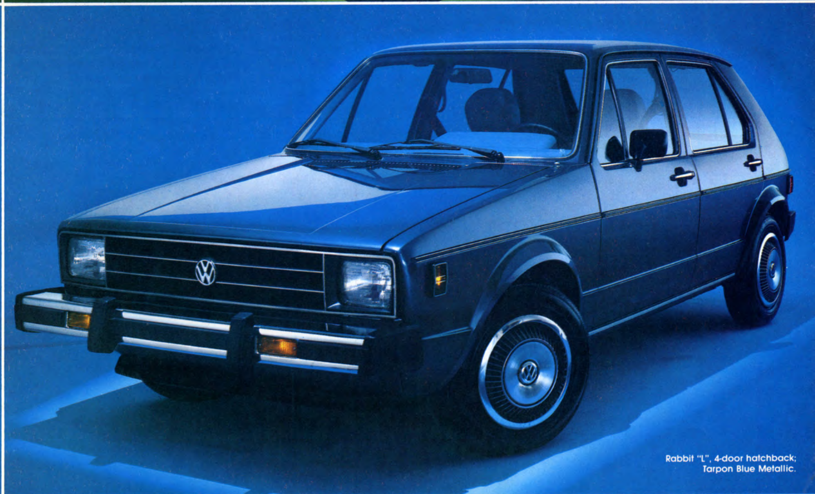
Rabbit "L", 4-door hatchback; Tarpon Blue Metallic.