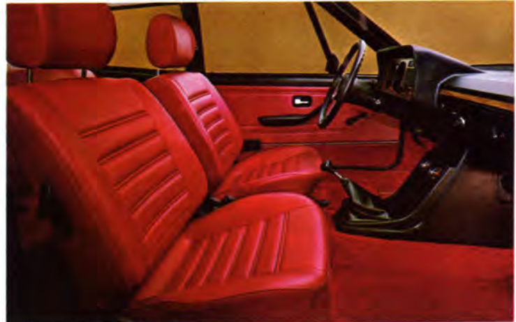
Scirocco interior, Red Leatherette. Both front seats have individual height adjustments, standard.