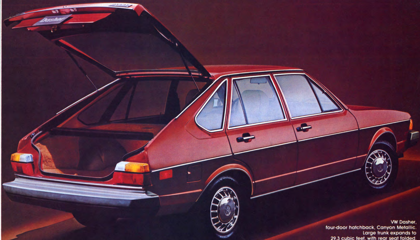
VW Dasher, four-door hatchback, Canyon Metallic. Large trunk expands to 29.3 cubic feet, with rear seat folded.