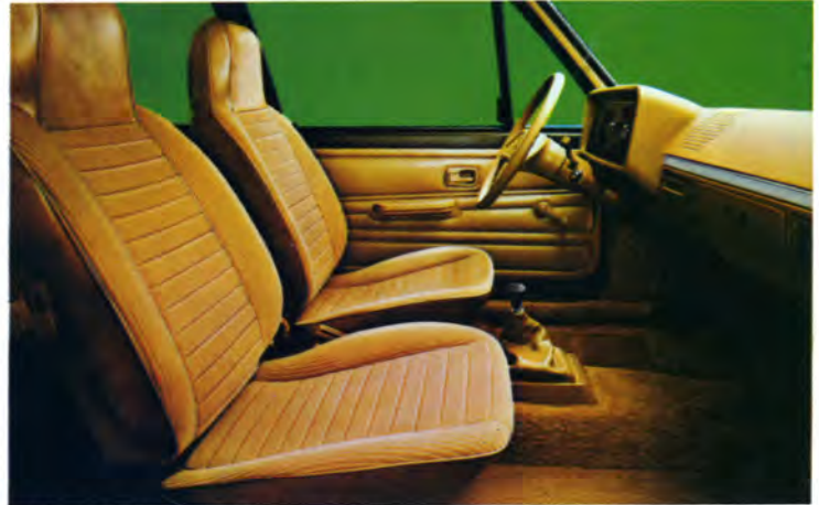
Rabbit "C" ribbed cloth interior, Tan.

*1979 EPA estimates. Remember: compare these estimates to the estimated mpg of other cars. Your actual mileage may vary depending on speed, weather, and trip length. Your actual city and highway mileage may be less. 1980 EPA estimates not available at printing time, 1 August 1979.